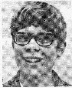
winners of Schubert Club Scholarships.